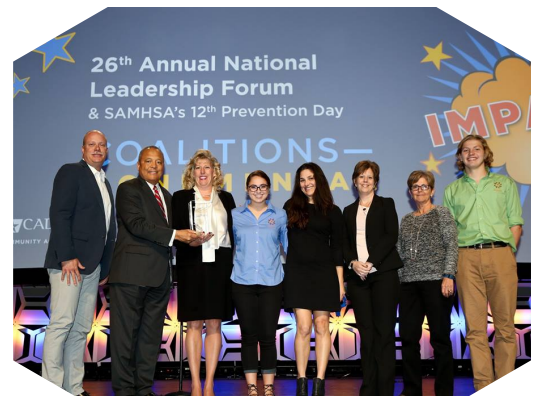
HCC was named CADCA's National Coalition of the Year in 2016 for our outcome-based work.

The HCC was formed in 2003 as a task force when school district staff learned that Hernando students had some of the highest rates of alcohol and tobacco use in the State. The work of the HCC is funded through grants or contracts (mainly State or Federal resources), through small foundation awards or donations, and by the in-kind resources of community partners. Since incorporating in 2004 as a separate entity to focus on substance-related problems, the HCC partners have made significant progress reducing youth substance use.